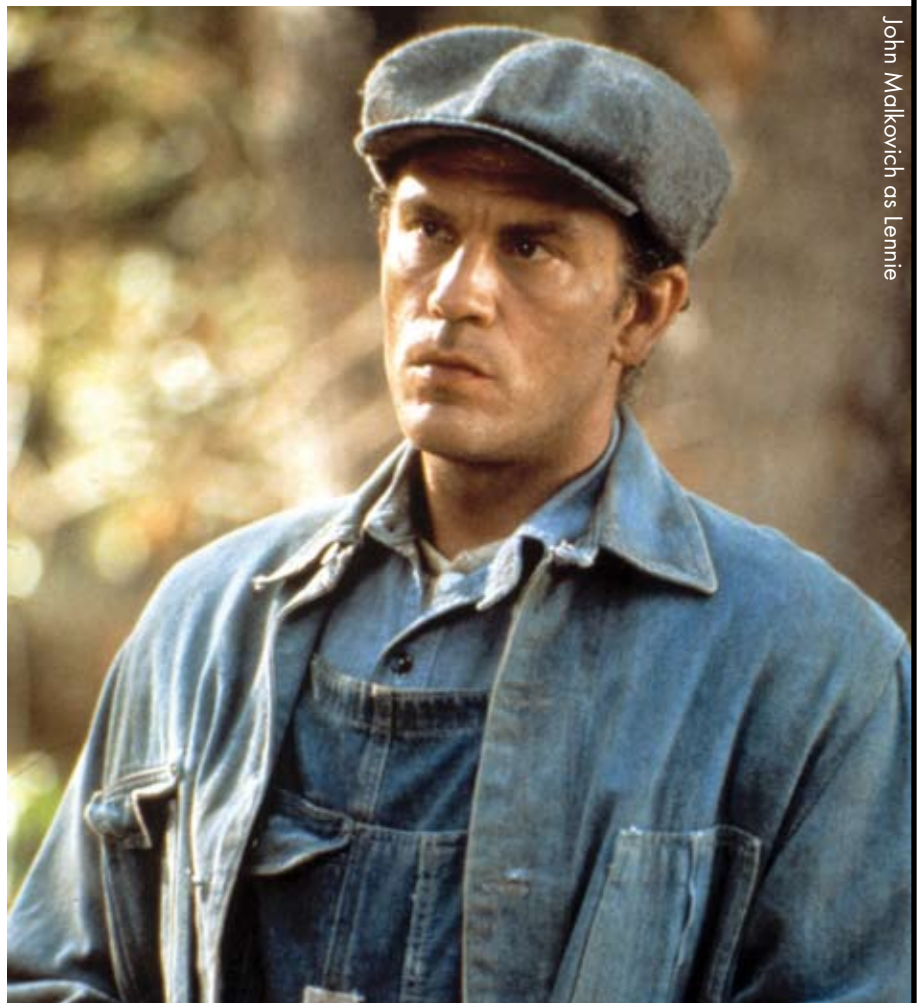
John Malkovich as Lennie